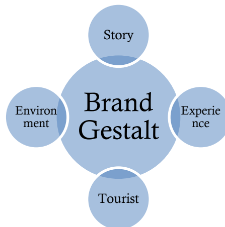
Fig 2. Mandagi et al, 2021

The participation of local communities can develop tourism and can increase positive things in terms of the social and economic elements of the local population (Setiawan et al 2020). Gestalt brand has 4 dimensions according to (Mandagi et al., 2021) namely story, environment, experience, and stakeholders (fig 2).